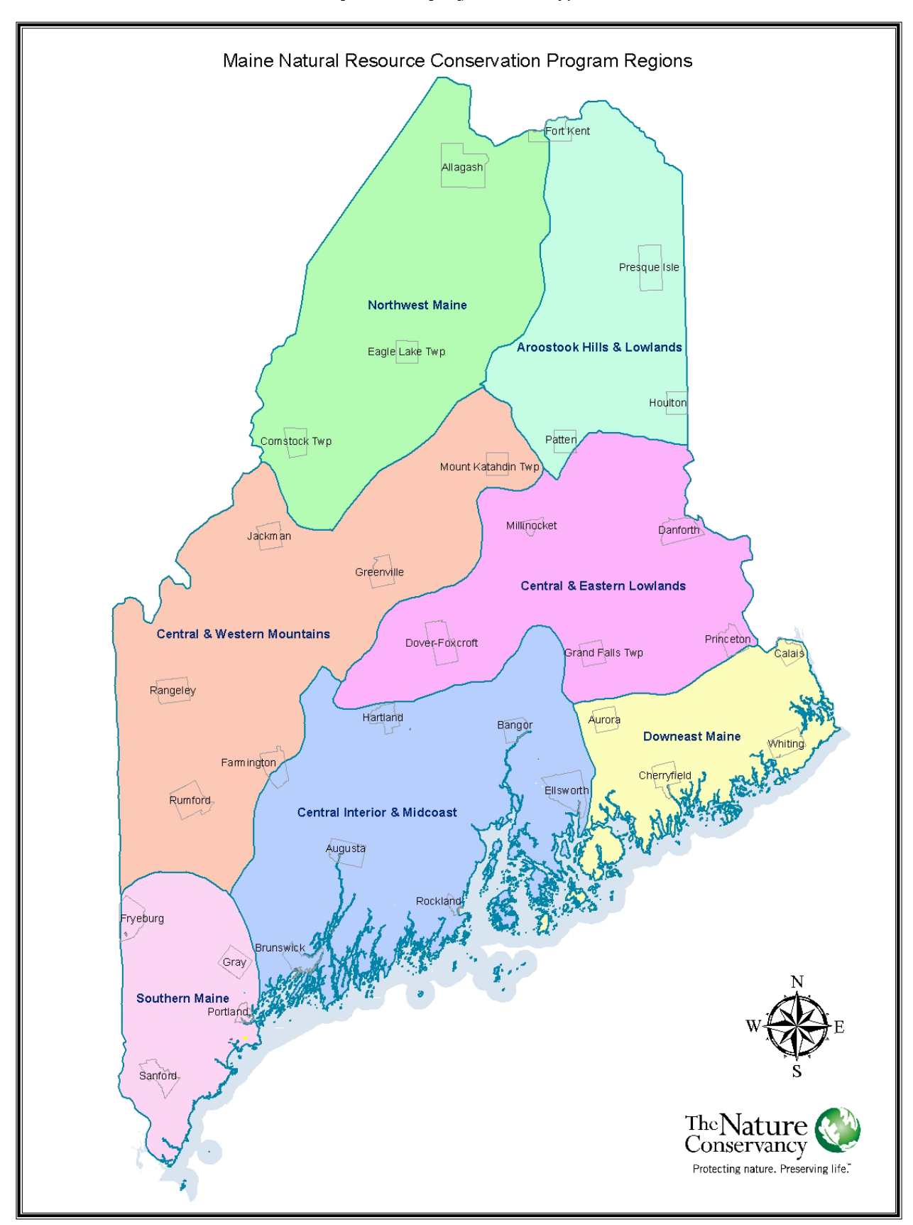
Appendix A Map of Biophysical Regions